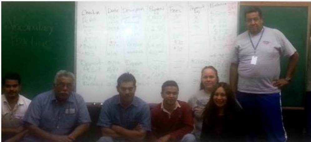
Students at AAMA taking part in a "Kick Your Career Into Shape" class

Finally, check out this outstanding video created by Encore.org.